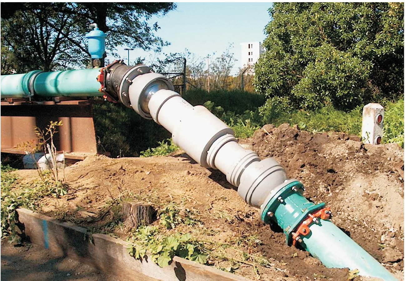
FIG. 1 DN200 Force Balanced Flex-Tend