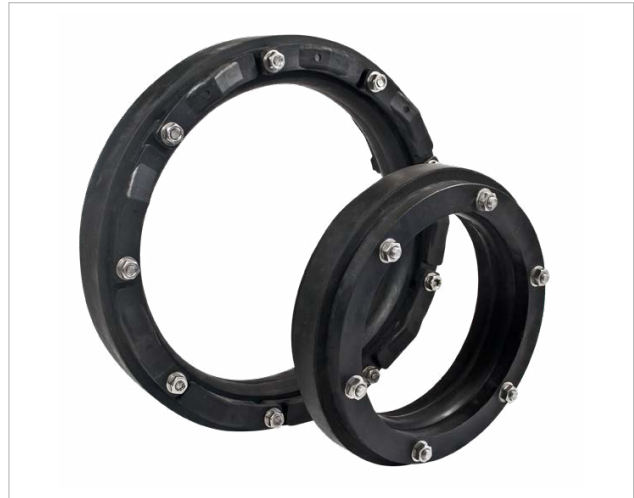
FIG. 1 Linked Seal, Standard Seal