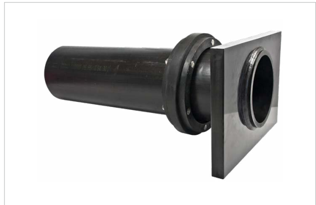
FIG. 2 Optional Flanged PE manhole connector and standard seal