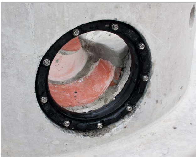
FIG. 3 Hyseal ready to connect pipe