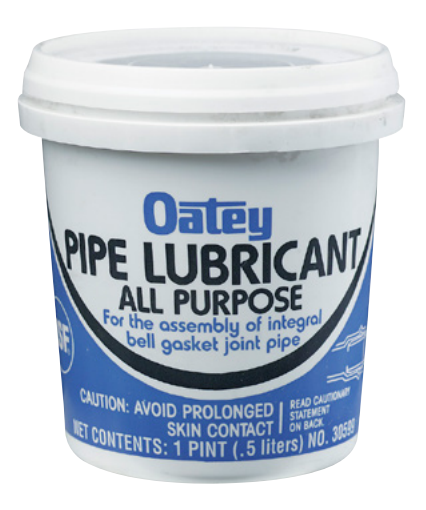
FIG. 1 As/Nzs 4020 Compliancy gained through the Australian Water Quality Centre