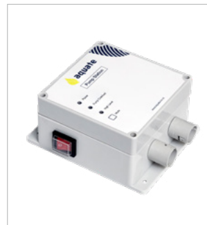
FIG. 2 Controller – manufactured to AS/NZS 3000:2007

For larger systems, additional features can be included if required.