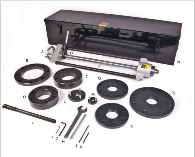
FIG. 2 Compact C6 Tapping Tool Complete Kit