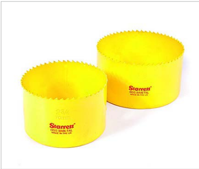
FIG. 4 Bi-Metal Holesaw