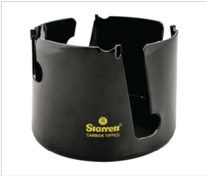
FIG. 5 MPH Cutter