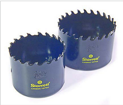
FIG. 3 Carbide Holesaw