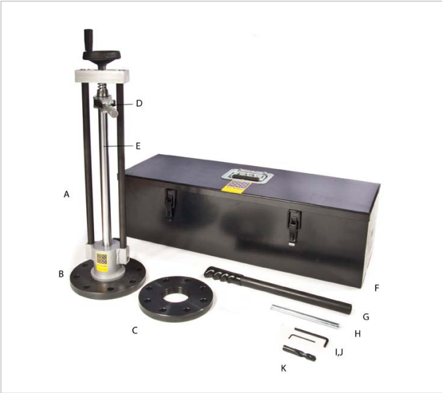
FIG. 1 Compact C4 Tapping Tool Complete Kit