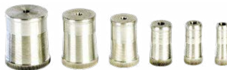
FIG. 3 Calderprep™ Plus Mandrel Inserts 20-25-32-40-50-63mm