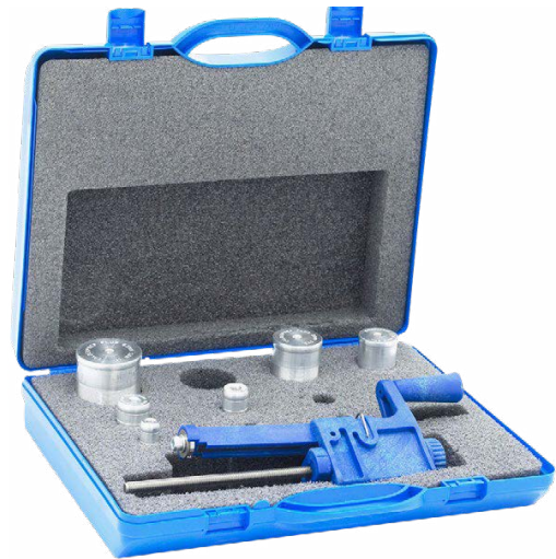
FIG. 1 Calderprep™ Plus Tool Kit